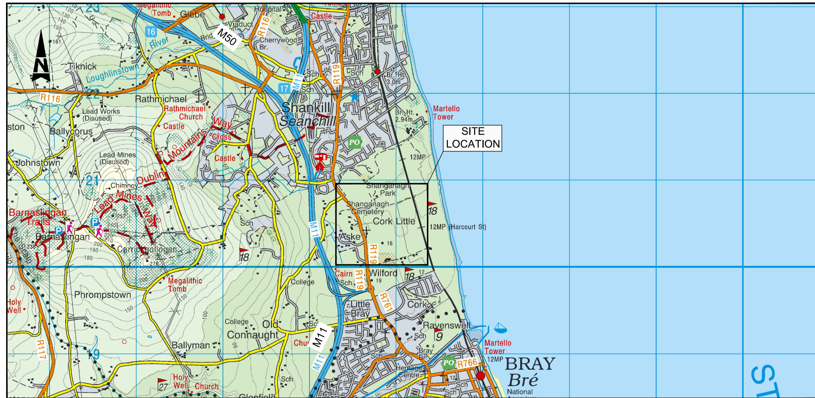
SITE MAP - SUB PROJECT Scale at A1 1:25,000 Scale at A3 1:50,000

© ORDNANCE SURVEY IRELAND LICENSE No. AR 0082518 ORDNANCE SURVEY IRELAND & GOVERNMENT OF IRELAND